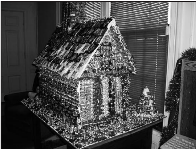
This holiday donation of a candy house from Aspirus Keweenaw Fitness Center made kids of all ages happy.

408.5 hours of volunteer direct service were provided.